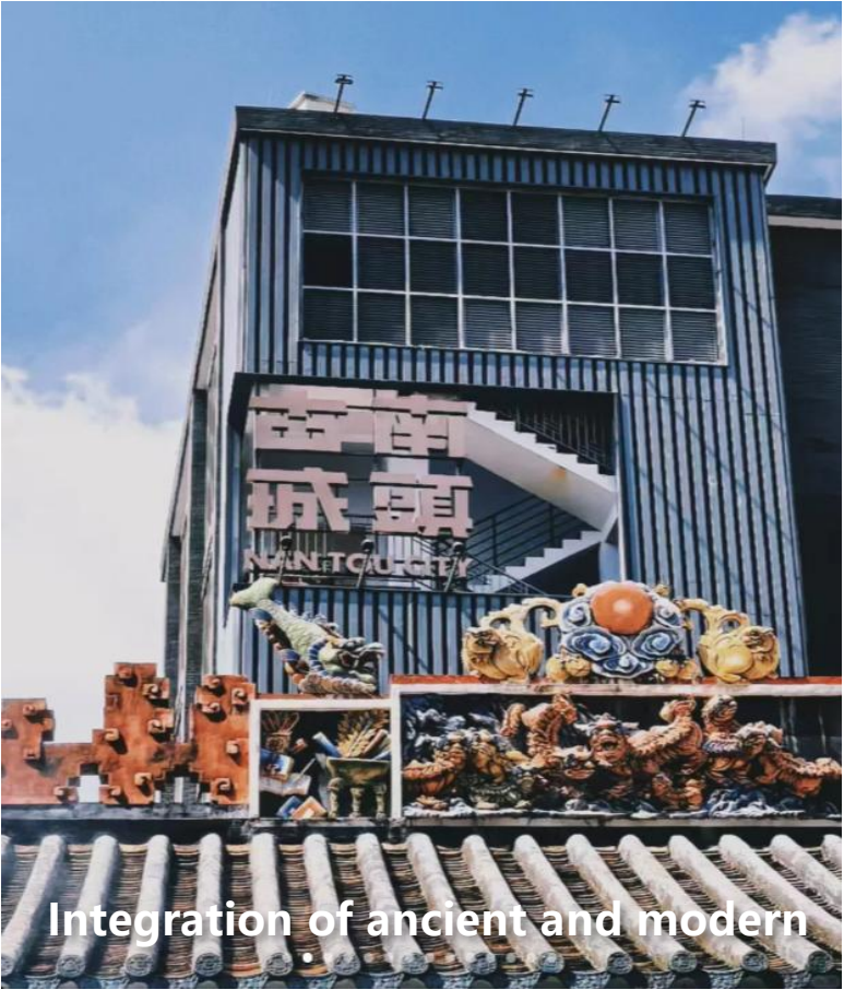
Integration of ancient and modern