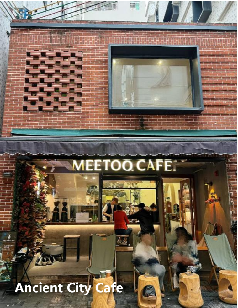
Ancient City Cafe