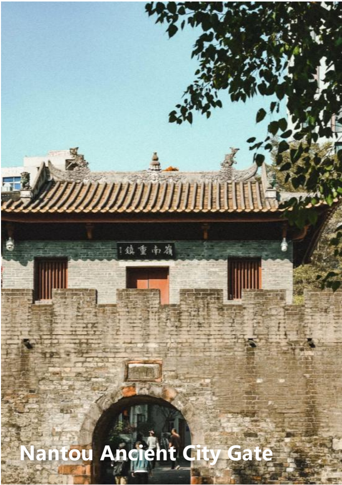
Nantou Ancient City Gate

life, unfolding along its streets and alleys.