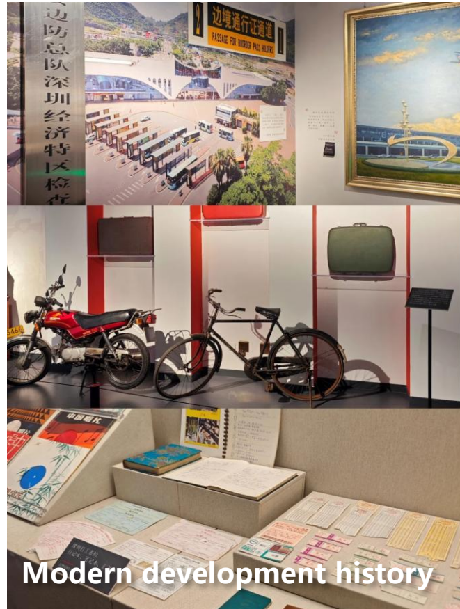
Modern development history